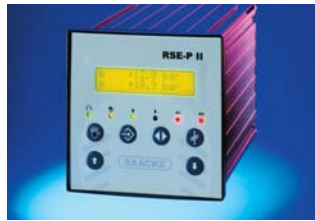
D - \mu P controller RSE-P II