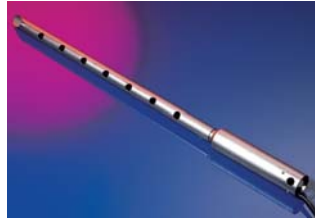
B - O 2 Feedback Control