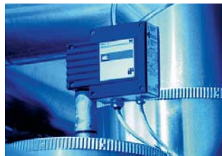
F - Level Monitor

In the course of the service life of a heat generator it is necessary to upgrade periodically to keep abreast with advances in technology and changes in industry legislation. SAACKE offers an extensive program for this purpose: