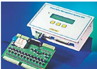
E - IMS Information Management System