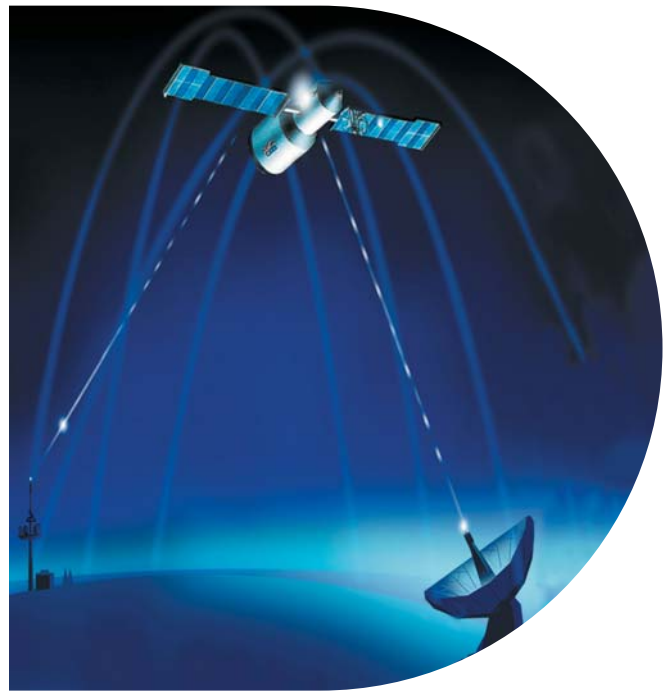
Tele support & service replaces external servicing in many cases.

Our service is geared to one aim: to secure the functioning of your burners for many years - economic, eco-friendly, reliable!