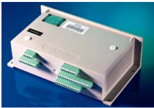
C - Automatic Firing Sequence Control